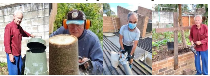
Lockdown - Staying home. Time together.

Scan the barcode on the left with your mobile phone camera and follow the instructions therein. https://www.bpoint.com.au/pay/COMOOYSTERBAYPARISH