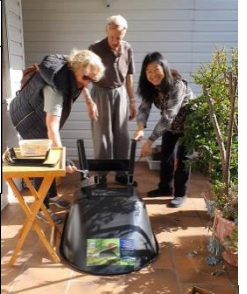
Wheelbarrow very much needed.

We acknowledge and pay our respects to the traditional custodians, past and present, of this land of the Gweagal People of the Dharawal Nation SVdP Christmas Appeal: Approximately 60 hampers will be distributed to local disadvantaged families especially during this very tough time of year. Your generous financial support during our Appeal on the weekend of 5 th / 6 th December will be gratefully accepted. All donations over $2 are 100% tax deductible. Special envelopes will be distributed on that weekend for tax receipts. A collection box will be available for new non-perishable goods and toys for the hampers.