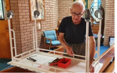
IKEA products are not easy to assemble.

The Woronora River Ensemble will give a Christmas concert in the Parish Hall at 12 noon on 12 th December. Due to Covid-19, number of patrons is strictly limited to 40 . Admission by registration through the Parish Office.