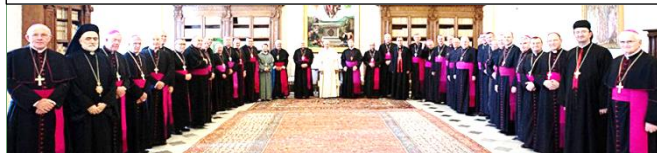
Ad Limina Apostolorum (To the Threshold of the Apostles)

+Peter's Pence Appeal this Sunday 30 th June. Former Pontiffs as well as Pope Francis have manifested their attention to the Peter's Pence Collection as a form of support given by believers to the Successors of St Peter's ministry to the universal Church. The faithful's offerings to the Holy Father are destined to Church needs, to humanitarian initiatives and social promotion projects, as well as to the support of the Holy See. The Pope, being Pastor of the whole Church, is attentive to the material needs of poor dioceses, religious institutes and of faithful in grave difficulties (the poor, children, the elderly, those marginalized and the victims of war or natural disasters; concrete aid to Bishops or dioceses in need, Catholic education, assistance to refugees and immigrants, etc.). The primary source of support for the Apostolic See should be in offerings freely given by Catholics throughout the whole world, and by other persons of good will. This is in harmony with a tradition dating back to the Gospel (cf. Lk 10:7) and the teaching of the Apostles (cf. 1 Cor 9:11-14) Please note it is not a tax deductible appeal.