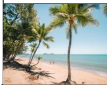
Greetings from Cairns

Greetings from (Apple cider museum) Huon Valley Tasmania