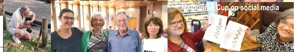
Metbourne Cup on social media

"And why is the devil envious?" asked the Pope: he is envious "of our human nature". Do you know why? Because the Son of God became one of us. The devil cannot bear that. That is why he destroys, said Pope Francis, and that is "the root of the devil's envy, the root of our evils, our temptations, it is the root of wars, hunger, of all the calamities in the world". It is not usual to destroy and sow hatred, the Pope continued, not even in politics. "But some people do it". Often one politician is tempted to sling mud at another, "to destroy the other", using both lies and truth. This is not healthy and clean political rivalry "for the good of the country". Those kinds of politicians use insults to diminish their opponent, afraid they may appear more competent." (12 th Nov. Pope Francis).