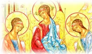
Solemnity of The Holy Trinity