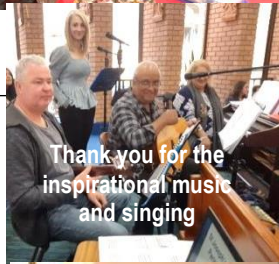
Thank you for the inspirational music and singing

POLICE REMEMBRANCE DAY SERVICE to be held at St Catherine Labouré Catholic Church, Gympie. This service will commence at 10.30 am on Friday, 27 September 2019. A welcome is extended to all.