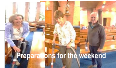
Preparations for the weekend

Palms Meet and Greet: Saturday September 21 st @ 2pm John Street Cafe Dooley's Catholic Club 11-17 Church St, LIDCOMBE